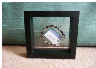
Small - $20.00

These boxes are great for displaying your jewelry when you are not wearing it or for displaying your horse's hair, photos or other items.