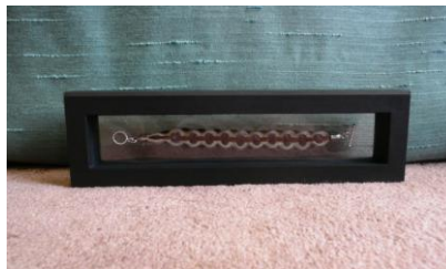
Long - $20.00