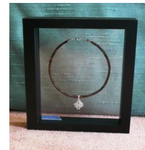
Big - $30.00